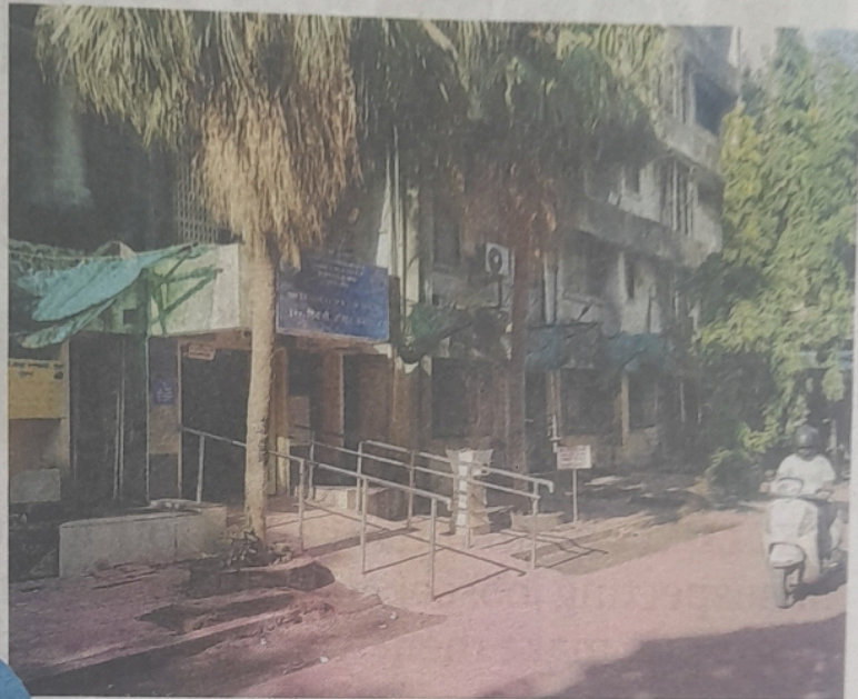
The entrance of the hostel where nets have been strung to catch falling plaster; (below) plaster from the wall has fallen off, exposing the iron rods which are completely rusted

No. of resident doctors living in the hostel