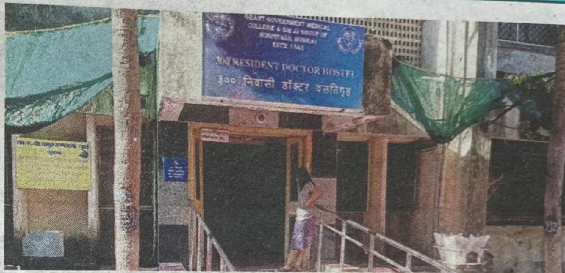
The ailing JJ hostel in Byculla

State Human Rights Commission slams senior officials for not filing affidavits explaining their side, as it seeks accountability for crumbling hostel